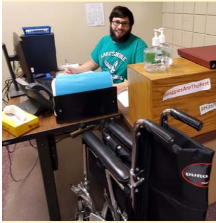
The temporary main office and the temporary health office are to your left as you enter the temporary main entrance off the sculpture garden.