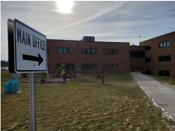
OUTSIDE: The front entrance of the Middle School is fenced off and closed for construction. Signs are up for the temporary main entrance to the Middle School, near the sculpture garden.