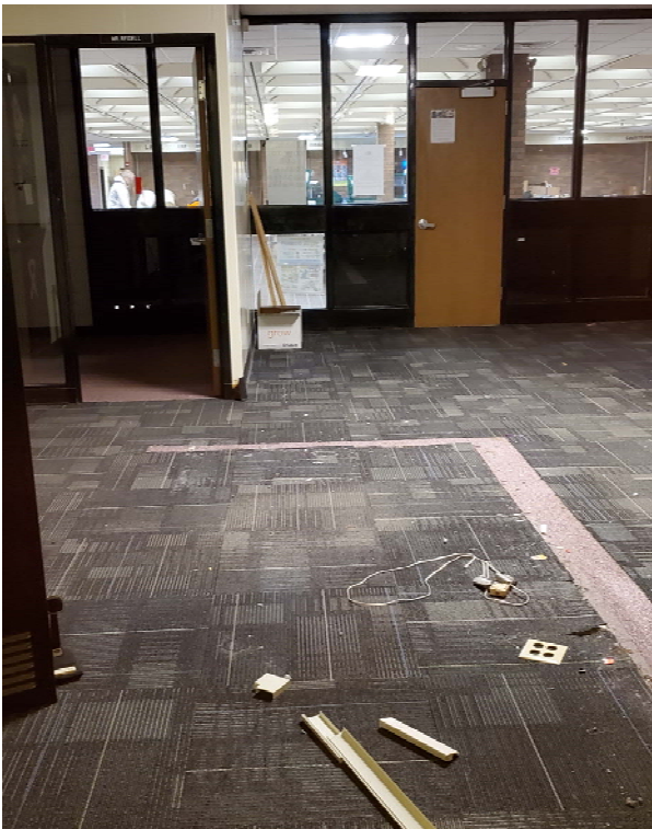
The former Main Office area is vacant and cleared out in preparation for construction work at the front of the building.